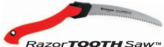
RazorTOOTH Saw™ FOLDING PRUNING SAW RS16150 | 10 IN. BLADE