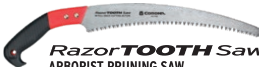
RazorTOOTH Saw™ ARBORIST PRUNING SAW RS 7120 | 13 IN. BLADE