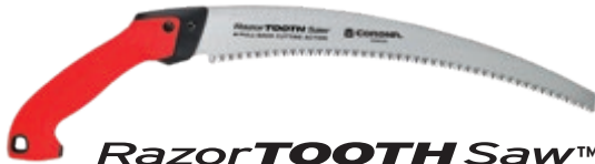
RazorTOOTH Saw™ PRUNING SAW, RS16020 | 14 IN. BLADE