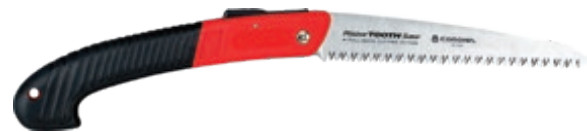
RazorTOOTH Saw™ ARBORIST FOLDING PRUNING SAW RS 7041 | 7 IN. BLADE