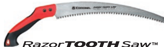
RazorTOOTH Saw™ PRUNING SAW, RS 7395 | 14 IN. BLADE