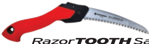
RazorTOOTH Saw™ FOLDING PRUNING SAW RS16120 | 7 IN. BLADE